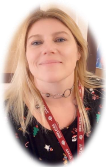
Mrs Lean Foundation