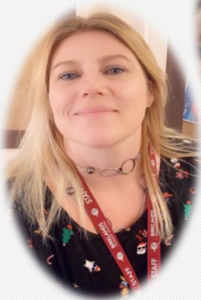
Mrs Lean Foundation