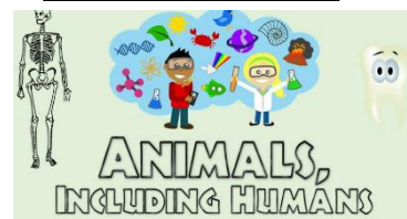
Animals including humans